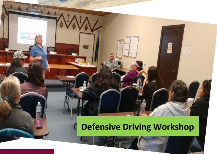
Defensive Driving Workshop