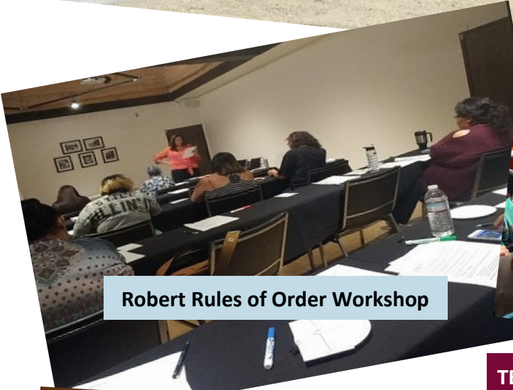
Robert Rules of Order Workshop